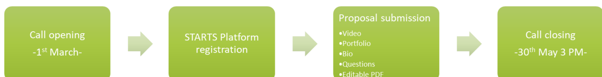
Figure 1. Call process diagram

The first Re-FREAM call will be launched on 1 st of March 2019 and will close the 30 th of May at 3 PM. All interested artists will be able to submit their application through the STARTS Platform at any time during the open call. In this Platform, artists will be able to answer the questions and upload the documents asked in order to submit the proposal. FIGURE 1 shows the call process diagram.