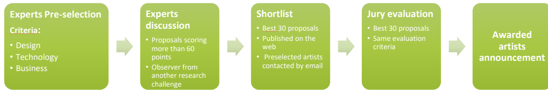
Figure 2. Selection process diagram

The evaluation criteria followed is widely explained in the next section.