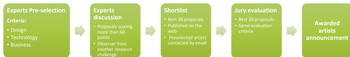
Figure 2. Selection process diagram

The evaluation criteria followed is widely explained in the Helpdesk section: Evaluation Criteria.