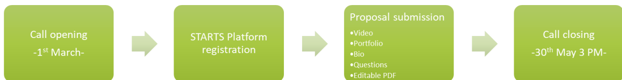
Figure 1. Call process diagram

After the closing of the call, artists will be able to follow the evaluation process. Call will be opened from 1 st March to 30 th May (3 PM).